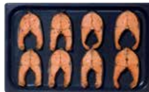
GN 1/1 crosswise insertion

Your benefits: a huge plus in capacity as well as increased productivity. Our flexibility concept speeds up all of the various processes in professional kitchens. And you not only save time, but valuable energy as well.